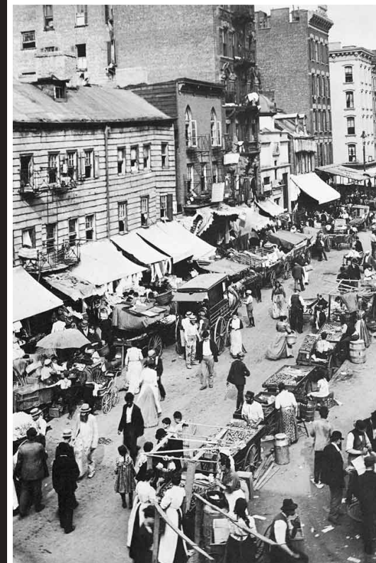
Lower East Side Tenements

Brownstones: An expensive style of building made from sandstone and that has a brownish-red color.