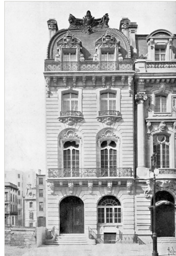
Upper East Side Mansion

The Upper East Side of New York City was and is much larger than the Lower East Side. Spanning from 59th Street to 110th Street and 5th Avenue to the East River, the Upper East Side was also an attractive place for immigrants. In the late 1860s development of the Upper East Side began. The new concept of public transportation made it easier for Upper East Side residents to travel throughout New York City and the building of brownstones and mansions on 5th Avenue invited a more wealthy population of high-society moguls, debutantes, and heirs. As a result, the Upper East Side became a very ritzy and glamorous place to live.